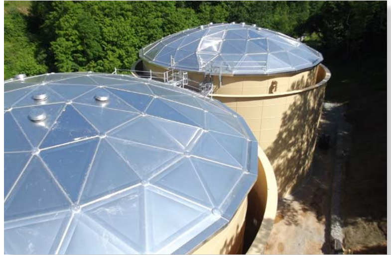
Secondary containment utilizing LIQ Fusion 7000 FBE™