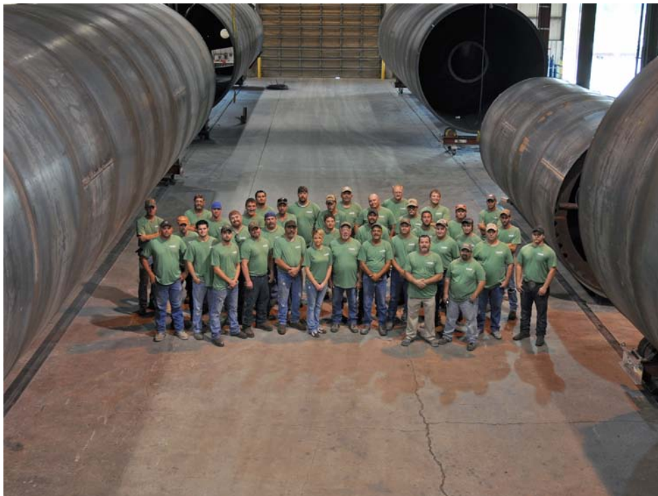
Building the BEST in Shop-Welded Tank Construction!