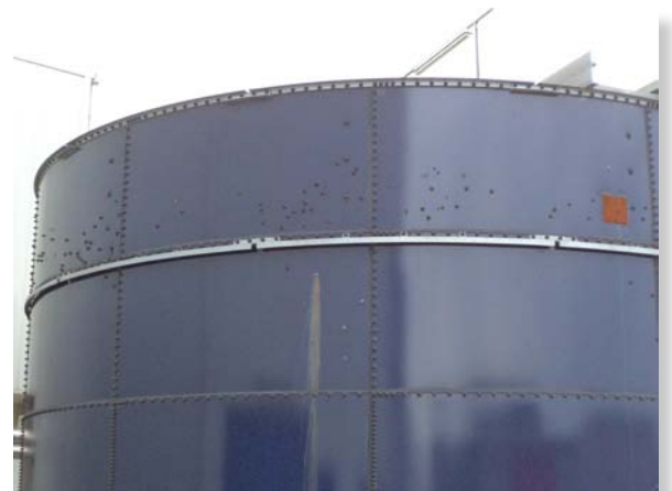
All the spot blemishes you see are defects on these glass coated panels, which are less than 2 years old. The involved application is the storage of animal waste.

“It is as independent as some of the comments posted on the previous thread which were only positive about glass coated. As I said we would happily sell both but we are just educating the market on available options and what the customers should be aware of. Epoxy tanks are as good as glass... which was not the case when Malgar were in the business. I could post hundreds of photos of glass tanks less than 10 years old with holes all over them. I don’t because there will be a reason. The fact remains, and it is provable, that glass slurry stores are the lowest grade enamel available where as epoxy isn’t, hence the higher test standards for epoxy...”