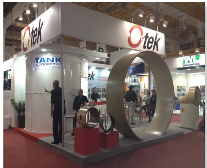
Meet our friends at OTEK!