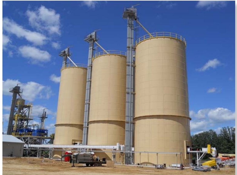
Big & Beautiful - From the ground up . . . and it's all Tank Connection!

Under product review, our clients routinely acknowledge that "so called" competitors offer lighter and cheap quality storage products compared to TC products and services. The simple facts are that the other brand companies can't compete with TC with an equitable quality offering. To date, we have never witnessed such a high level of "junk offerings" in the storage industry. From 2 year old "glass coated" tanks that are failing in the field to storage tanks that are loaded with stiffeners from top to bottom, the offering of low quality storage products has never been so pronounced in the industry. The service life on some of these products can only be described as pathetic. It most certainly is a "buyers beware" market.