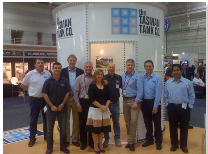
Meet our friends at Tasman!

We still have a few stops left to make before the year winds down; we're looking forward to seeing old friends, and meeting newcomers as well. Our next stop on the "international tour" will keep us closer to home this time, as we visit WEFTEC in New Orleans from Oct 1-3. Come visit with us to learn more about the innovative solutions and continual development underway at Tank Connection. We hope to see you there!