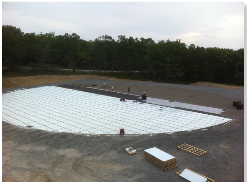
Although we offer both bolted steel floors (coated with LIQ Fusion 7000 FBE™) and concrete floors, significant savings can be realized when a bolted steel floor design is utilized.