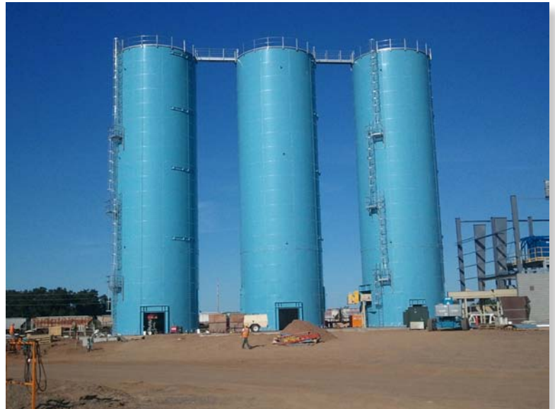
Dry bulk storage utilizing EXT Fusion 5000 FBE™ & SDP™