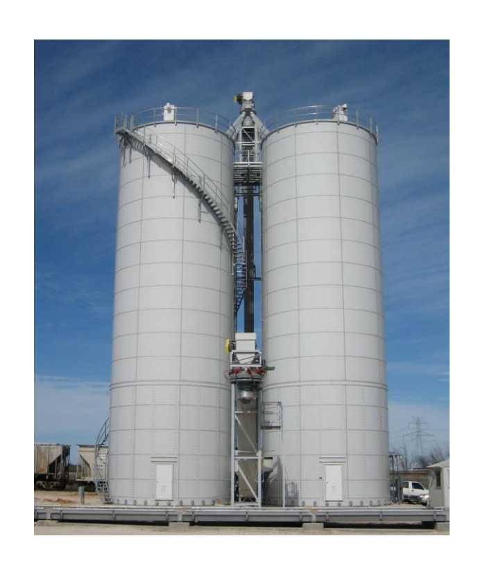
We build premier turnkey frac sand storage terminals from the ground up!

Adjacent picture depicts integrated sand storage and truck load out terminal.