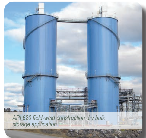
API 620 field-weld construction dry bulk storage application

Field-weld construction that does not minimize the large piece count in the shop and/or is not subject to radiograph examination (both in the shop and the field) per API 650 should be considered no better than "Tier D" quality.