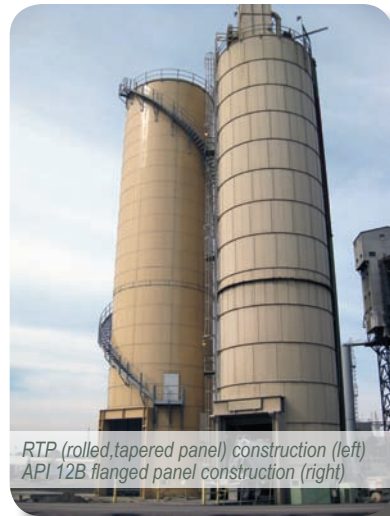
RTP (rolled, tapered panel) construction (left) API 12B flanged panel construction (right)

In bolted construction, the bolted RTP (rolled, tapered panel) design is the top performance product offered in the industry today worldwide. It is the premier product and it is outdating other types of bolted tank construction. API 12B (flanged panel tank) is an older bolted tank design that has incurred too many field leak issues in dry bulk and liquid storage applications and is being replaced by the RTP design. A newly introduced storage product is the vertical FP (flat panel) design, which is being promoted as another replacement for API 12B construction. The vertical FP design