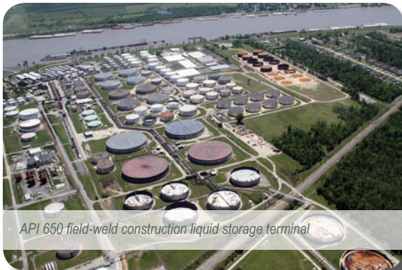
API 650 field-weld construction liquid storage terminal