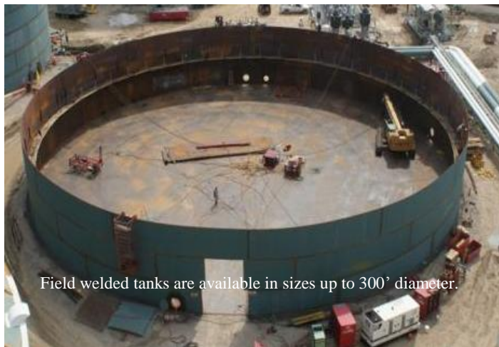
Field welded tanks are available in sizes up to 300' diameter.