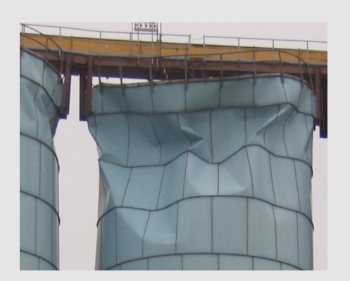
Damage due to improper design